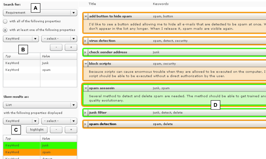
Figure 1: The list visualization shows information in a clear and linear way.

Each modification of the filters leads to an update of the list, allowing the user to instantly notice the effects caused by the modification. Because a list is a well known representation paradigm and frequent changes of the displayed information do not result in new layouts, but stay in the same linear structure, the user do not get lost while narrow down the list by filters. The possibility to order the list by certain properties can additionally help to force the list in a clear structure to better keep track of changes and updates. To see the instances in more detail, for example to see the description of a requirement (see figure 1, D), the user can open and close them via a dropdown method. It is possible to open several instances simultaneously and hence become able to better compare them in detail. So the list acts as a multi-accordion where instances can be opened and closed user-defined and independently.