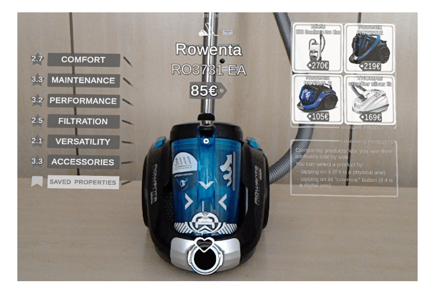
Figure 1: Overview of the prototype. The attributes of a product are presented on the left side, while recommended items appear on the right side.

RecSys '20, September 22-26, 2020, Virtual Event, Brazil