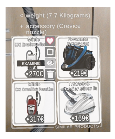
Figure 5: Recommended items. Critiqued attributes are listed above them.

RecSys '20, September 22-26, 2020, Virtual Event, Brazil