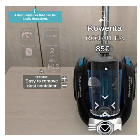
Figure 2: The selection of an attribute highlights it and shows a brief description of its meaning and where it is located in the product.

physical part is highlighted to allow direct inspection (Fig. 2). Some attributes act as containers for others attributes (e.g. if a product is powered by a battery, the battery itself has attributes too); these "sub-attributes" are normally hidden, but they will appear if the attribute that contains them is selected (Fig. 3).